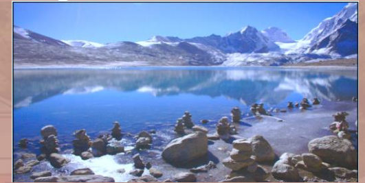
[Gurudongmar Lake, Sikki]

Shortlisted papers will be published in collaboration with Springer (Applied for).